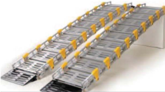
Fig 24 - Roll-a-Ramp Twin Track

Fig 23 ▲ 6ft long x 30" wide single width Roll-a-Ramp.