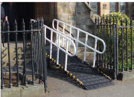
Fig 25 - Roll-a-Ramp Semi-Permanent Ramp

Fig 24 ▲ 6ft long x 12" wide twin track Roll-a-Ramp.